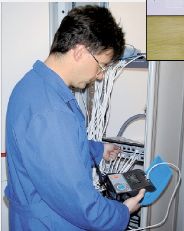
Example of troubleshooting in the LAN environment