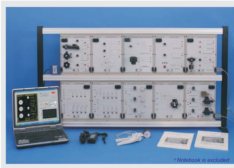
*Notebook is excluded

The KL-800A CAN BUS Autotronic Training System is a distributed control system supported by advanced serial bus system CAN (Controller Area Network). CAN is a multi-master bus with an open, linear structure with one bus line and equal nodes. The number of nodes are not limited by the protocol.